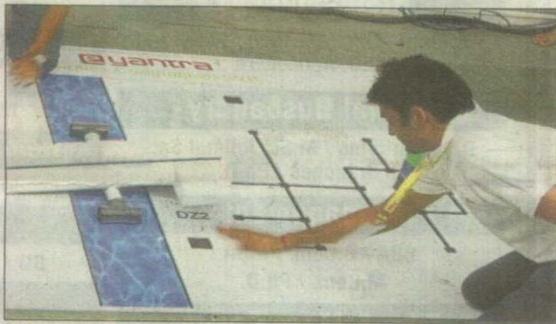
Young innovators get their act together at the e-Yantra contest at IIT Bombay.

e-Yantra is a national robotics outreach project of IIT Bombay funded by MHRD (GoI) and tar-